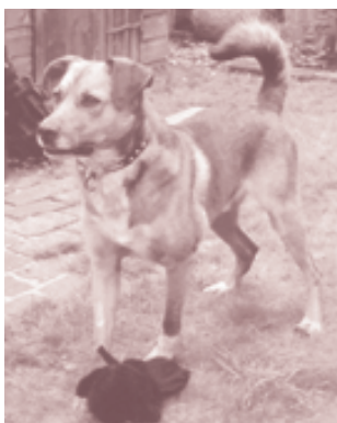
RSPCA SOLENT BRANCH

The RSPCA was called and Tyke was taken to the Stubbington Ark. Staff at The Ark were able to nurse him back to health and Tyke has since found a loving new home.