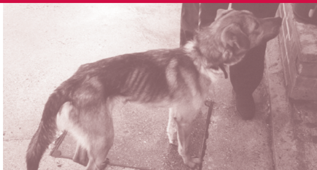
RSPCA SOLENT BRANCH

For around the cost of a Sunday newspaper each week you can sponsor a dog kennel, cat cabin or small animal unit and help give the animals in the care of the RSPCA Stubbington Ark and the RSPCA Veterinary Clinic Southampton the chance of a brighter future.